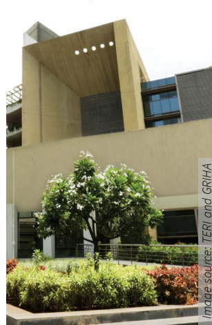
Pimpri Chinchwad New Town Development Authority with 5 Star Certification under the GRIHA green building rating system